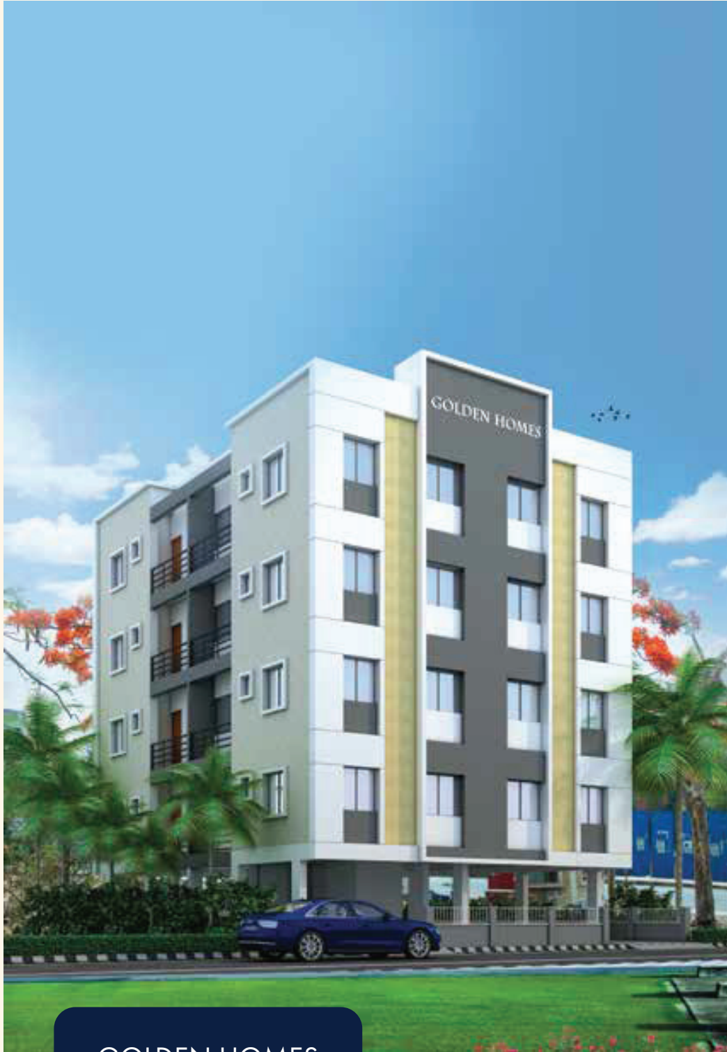
GOLDEN HOMES Ongoing Project