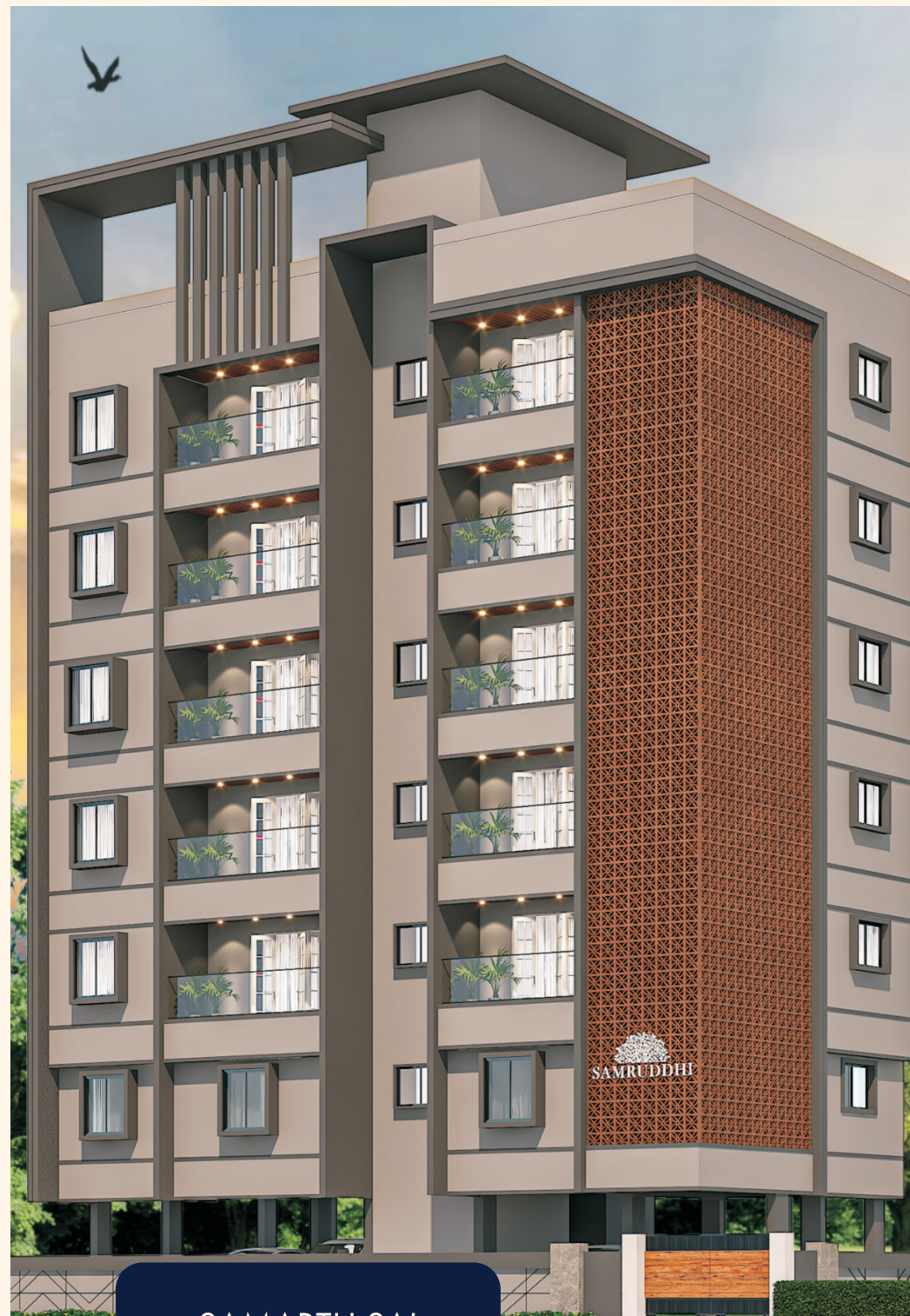
SAMARTH SAI Ongoing Project