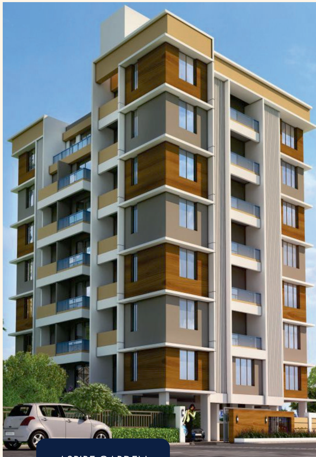
ASPIRE GARDEN Completed Project